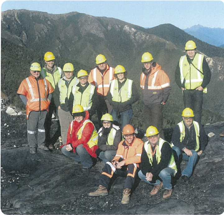
Participants in the inaugural Leadership and Governance Programme visiting Stockton mine.

The pool of West Coasters with leadership skills has had a boost with 13 local business people graduating from the inaugural Leadership and Governance Programme.